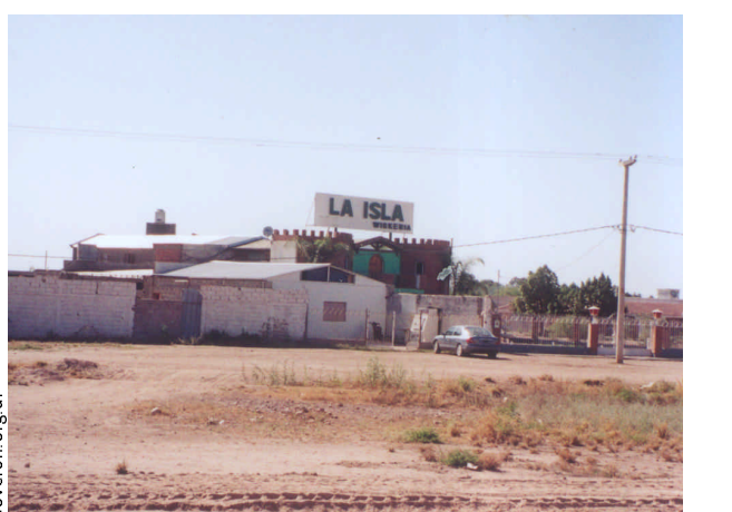
above: La Isla, a brothel in Rioja suspected of using trafficked women.

cooperation in anti-trafficking operations.