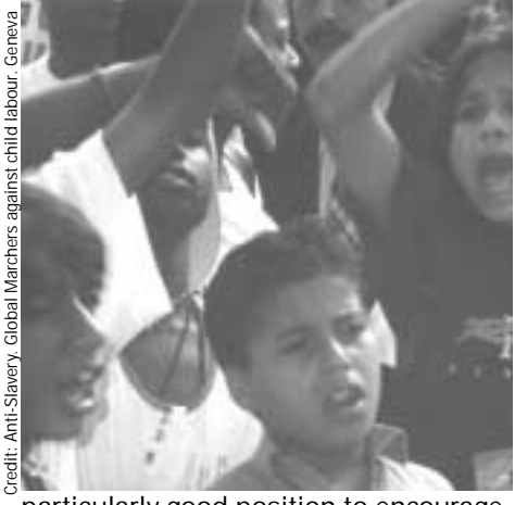
particularly good position to encourage implementation of C 182.