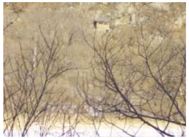
A North Korean guard post along the Tumen River.

(e.g. in contact with South Koreans or Christians or caught en route to South Korea). In general, the former were sent to a labour training camp (nodong danryundae) or a re-education camp (kyohwaso), while the latter were incarcerated in a political prison camp (kwanliso).