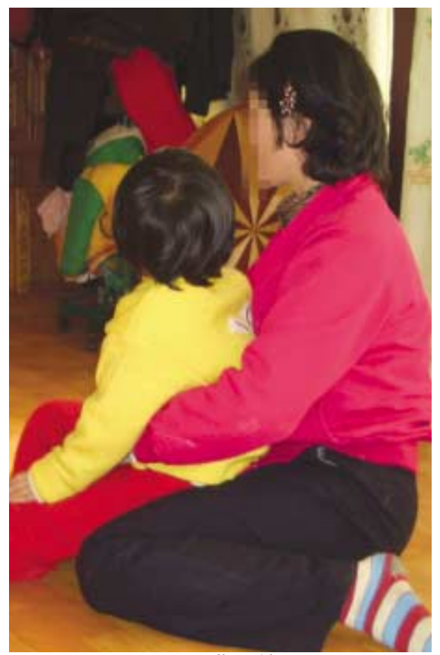
A North Korean woman married to a Chosun Jok farmer with her daughter.

In this political climate, North Koreans living in cities fear exposure from being reported by their Chinese neighbours, so they keep to themselves and avoid venturing outside their apartment. But this isolation makes them long for contact with other North Koreans. As many of the case studies indicate, this contact brings its own risks.