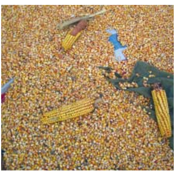
Corn kernels being dried in the sun.

Because I wasn't eating properly, my hair fell out in lumps - I still have bald patches today. Due to malnutrition, my nails were so weak that they would turn over. 100