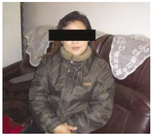
A North Korean interviewee.

asked. During a 40-minute trial in 2005, a woman from Kyongsong, aged 30, was only instructed to read out loud her confession. After she confirmed the validity of the statement, the officials sentenced her to six months in a reeducation camp. She was released for time served.<sup>119</sup>