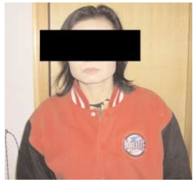
A North Korean interviewee.

Female prisoners used strips taken from their underclothes to use as sanitary napkins during their menstrual cycle. They sometimes had to use the strips again without washing them.<sup>96</sup>