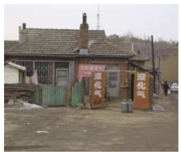
A rural neighbourhood in Jilin Province.

Rural residents, on the other hand, do not have the luxury of anonymity. Villagers know exactly where North Koreans live. One 28-year-old woman from Onsong was arrested three times by the same police because "all the villagers knew I was North Korean so when there was a crackdown, the police knew where to go". After the third arrest, she and her husband finally decided to move out of the rural village: