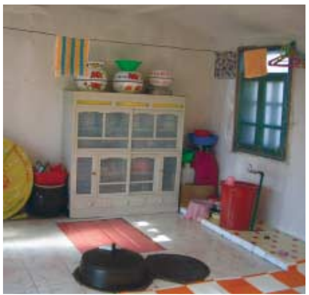
The kitchen of a rural farming household in Jilin Province.

Like the 38-year-old, many women who travel to China have aspirations of finding a job and sending money to their families. But once they arrive, they realise that earning money in China is not as straightforward as they previously believed. Their relatives or people with whom they stay inform them that it is dangerous in China and the best way to survive is through the protection of a man. From that point on, the women are easily convinced that they would be better off getting married to a Chinese man. They