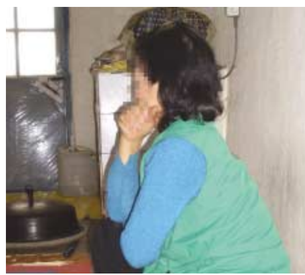
A North Korean interviewee

Forced labour at re-education camps is more intense than at any other prison camp. Prisoners who do not work hard enough or meet a daily quota are beaten by the guards. <sup>127</sup> In 2001, a woman from Orang, aged 35, was given a one-year sentence at kyohwaso number 55 in Yongkwang, South Hamgyeong Province. She had originally been sentenced to six months at a labour training camp but was given a double