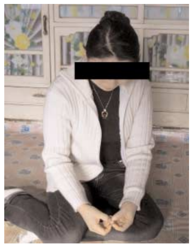
A North Korean interviewee

Prisoners invariably undergo a more intense and extended interrogation process when they are caught at a Chinese border area with a third country (e.g. with Mongolia or Vietnam), as it is assumed that they are seeking to defect to South Korea via a third country. A case in point is a 21-