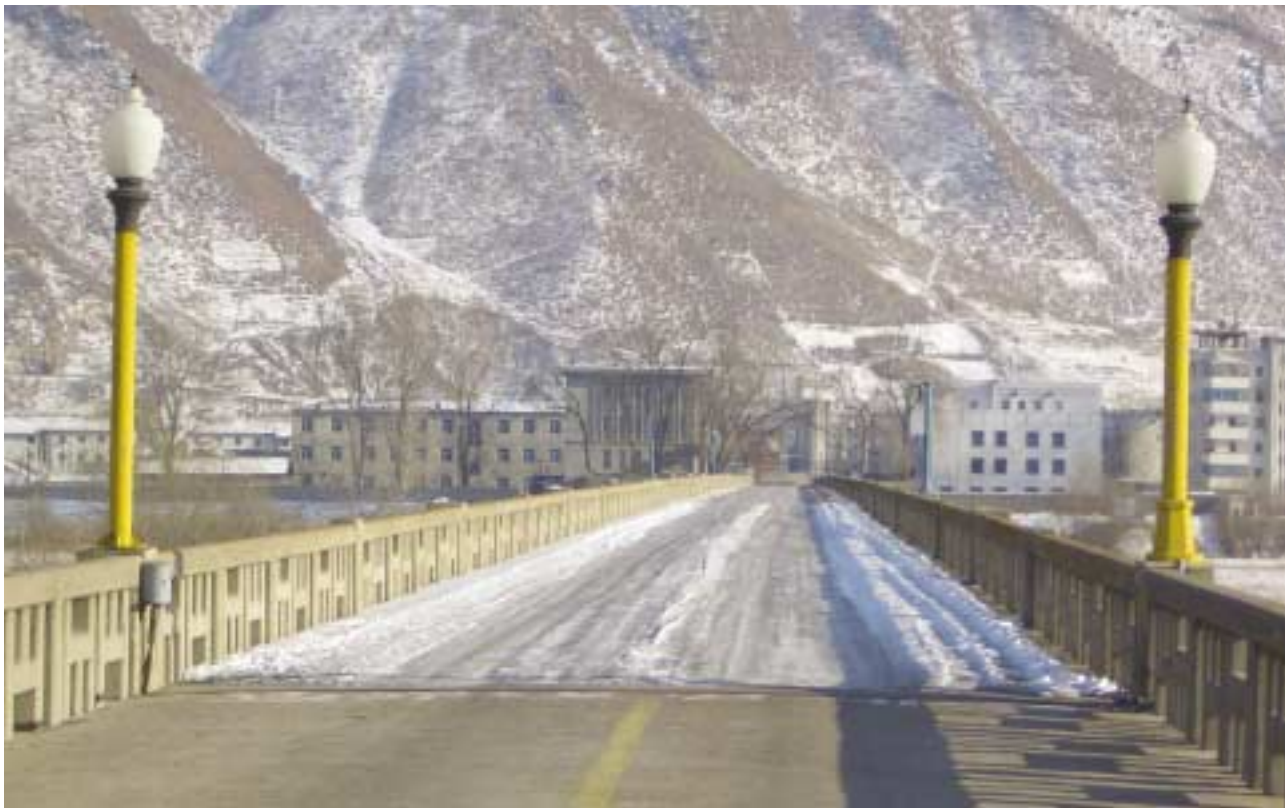
The Tumen Bridge.

Their personal details are registered again followed by a humiliating body search. Guards engage in a very thorough and invasive search because prisoners go to great lengths to hide money, either by wrapping it tightly in plastic before swallowing it or inserting it in their vagina or anus. The reason so many hide money is because they need it during their incarceration to buy food or medicine or to bribe guards (e.g. for better treatment or early release). Prisoners are told to undress, put their hands behind their head and squat and stand repeatedly with their legs spread wide while a guard watches for any money to drop from their private areas.