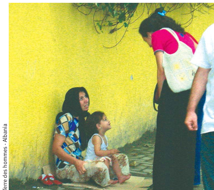
Terre des hommes - Albania

However, it is essential to recognise that children who are forced to beg by others commonly experience particularly severe abuse, which will be discussed in more detail in the next section. The major challenges in identifying children who have been forced to beg from amongst the vast numbers of child beggars must not be used as an excuse to avoid tackling these gross violations of children's rights.