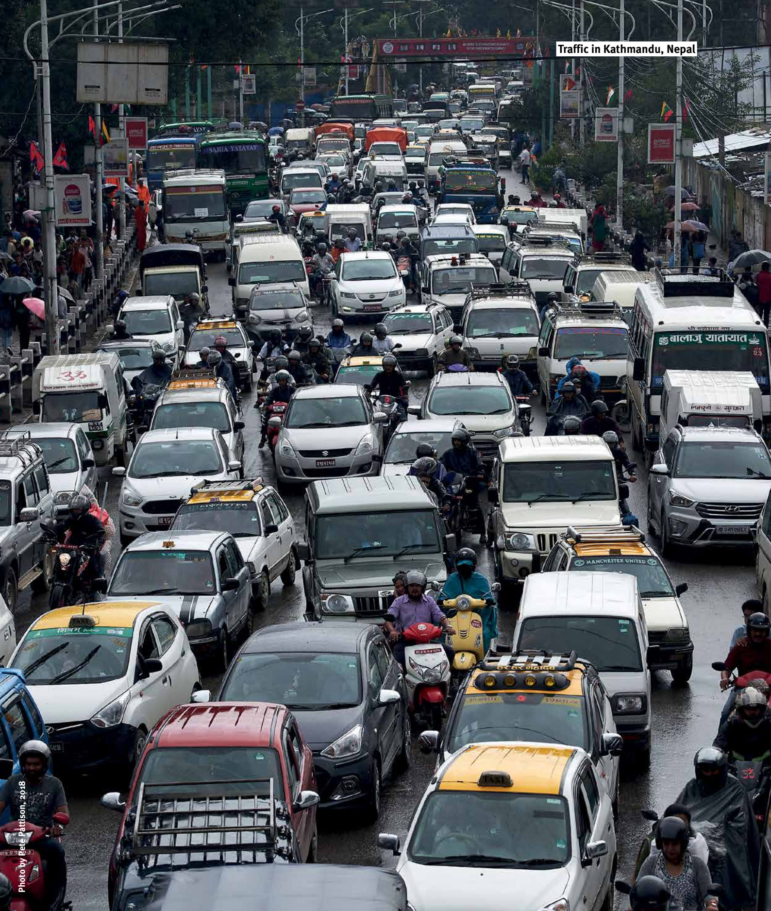
Traffic in Kathmandu, Nepal